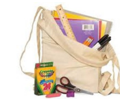
LWR school bags are a labor of love.

It might be hard to believe with our current weather, but fall will be here before we know it! Each year at this time we collect supplies and craft school bags for donation to Lutheran World Relief (LWR). Thank you to everyone who came out these past two Mondays. We made wonderful progress!