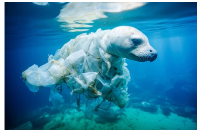
Wildlife often pay a hefty price when we fail to properly dispose of plastic.

Reuse: Reusable water bottles and coffee cups are functional, environmentally friendly, and look cool besides! Sometimes you might even get a small discount for bringing your own. The same is true for reusable shopping bags: they are functional, environmentally friendly, look nice, and you may get a discount. If you happen to forget your reusable bag, be sure to ask for a paper bag instead of a plastic one.