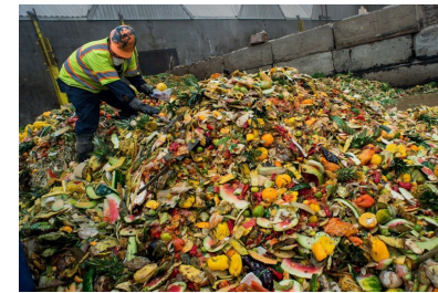
Find answers to the quiz on page 4.

Households are the greatest source of food waste in the US, making this a critical area for action. In 2022, nearly half of all surplus food across the supply chain was generated by consumers, for reasons ranging from spoilage, concerns about date labels, fear that something has been left out too long, and simply not wanting leftovers. Not understanding proper food management is a big cause of food waste.