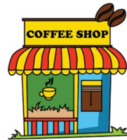
Grinds and Vines 3520 Southwest Yamhill Street, Portland, OR 97214

I am so excited to announce a brand new, community-focused event for younger adults, Night of Stories! This monthly event is a cooperative effort between three organizations: St Andrew, The Repentant Church (a recent start-up through the United Methodist Church), and Portland-based storytelling non-profit Ghost Light PDX. The first iteration of Night of Stories will be hosted on Sunday, March 24, 6:00 - 8:00 pm , at Grinds and Vines coffee shop in Portland. The theme for the night is "The Thousand Word Picture Show." Plans include a photo booth, caption contest, featured storytellers, live music, and the chance for you to share stories of your own in a safe, fun, and casual environment. No preparation is needed to attend; just come as you are!