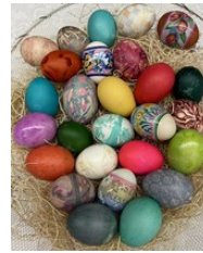
Transferring patterns from silk onto eggs is an art you can learn.

Remember those beautiful, intricately dyed eggs at last year's Easter brunch? Join Libby Calhoun on Saturday, March 30 , to learn this easy, yet elegant, craft. Please sign up in the Narthex.