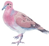
Christmas Eve Mourning Dove