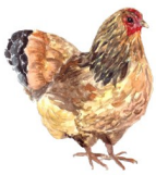
Week four of Advent Hen of Love

The congregation is invited to enrich the season of Advent with a new devotional from SALT. Pick up "The Dawn Chorus" at the entrance to the Sanctuary and initiate a weekly devotion as we prepare for the birth of the Christ child. The devotional comes in two parts: a booklet and a sheet of ornaments to cut out and decorate.