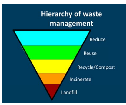
Recycling requires a lot of energy and it is not the best way to reduce waste.

I did not know this before, but Metro is a regional government in the greater Portland area. It's a 5th layer of government that we have that is unusual in most parts of the country. Metro includes most of Multnomah, Clackamas, and Washington counties, and it manages our garbage disposal and recycling for 1.5 million residents.