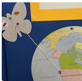
Our first traveling butterfly chose to stay in the Pacific Northwest. Where is yours headed this summer?

Check out the blue divider in the Narthex this weekend to see where our first traveling summer butterfly has gone. In God's "green season," the Worship Planning Team is encouraging St. Andrew people to stay in touch with each other by tracking their summer journeys.