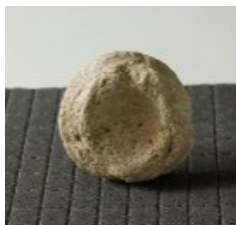
Ancient Greek TP