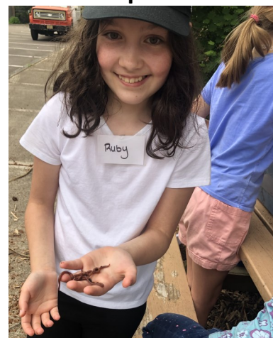
Happy worms in the compost. Happy kids at camp!