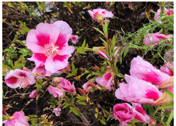
Another magnificent native meadow plant, Farewell to Spring ( Clarkia amoena ), burst into bloom in the Reformation Earth Garden just in time for Earth Camp 2022.