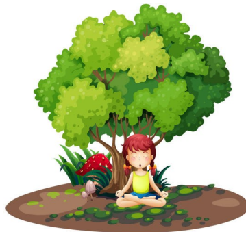
A shade tree can help you stay cool and collected when temperatures rise.

So what to do?!? If you are building a new home, use passive solar design principles. For those of us not building new homes: close the blinds on the sunny side of the house during the day, park your car outside until the engine cools before pulling into the garage, upgrade insulation, seal air leaks around windows and doors, install appropriate window treatments, plant shade trees, avoid turning