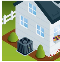
A traditional AC unit isn't the only way to cool our homes.

Air conditioning has been a wonderful, even lifesaving modern invention, but refrigerant gas leaks are harmful to humans and they're one of the contributors to global warming. Plus, air conditioners consume a lot of electricity. The electricity that is needed to run air conditioners is generated to a large degree by burning fossil fuels, such as coal and natural gas, which produce a large volume of carbon dioxide, also bad for the environment. Not to mention that the high electricity consumption of air conditioners is expensive. For more details on this topic, visit: