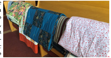
Pictured are just a few of the quilts made by St. Andrew's Nifty Notters for Lutheran World Relief.

After a pandemic pause that lasted more than a year and cancelled two ingatherings in 2020, Lutheran churches from all over Oregon and other parts of the Pacific Northwest, made the trip to St. Andrew again this past Friday and Saturday to share their contributions to LWR's worldwide relief efforts.