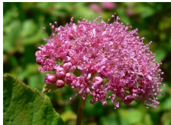
This beautiful native spiraea is one of the shrub varieties planted earlier this week.

Faith and Hope, the two Oregon white oak trees we planted in the garden last fall, survived the winter well, but the native crab apple put in the ground the very same day disappeared completely—probably munched on by a meandering deer. We know the deer also help themselves to plants in the Community Garden, but they take only what they need. Eric has already replaced the crab apple and we'll see how long this one lasts.