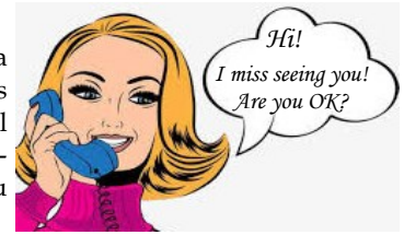
Table Talk: Are We a Nation of Child Abusers?