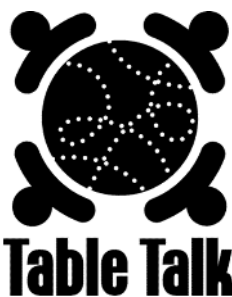
Table Talk: What the Voters Are Trying to Tell Us