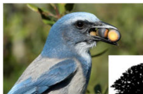
A native scrub jay enjoys a harvest of acorns from the Oregon white oak.

Reformation Sunday, October 25, 2020, at 1:00 pm