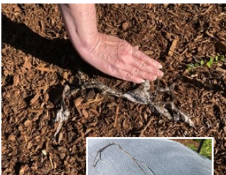
Before and After!